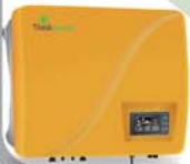
Optional color Yellow