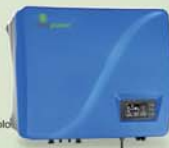
Optional color Blue