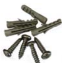
Installation Screw Packet